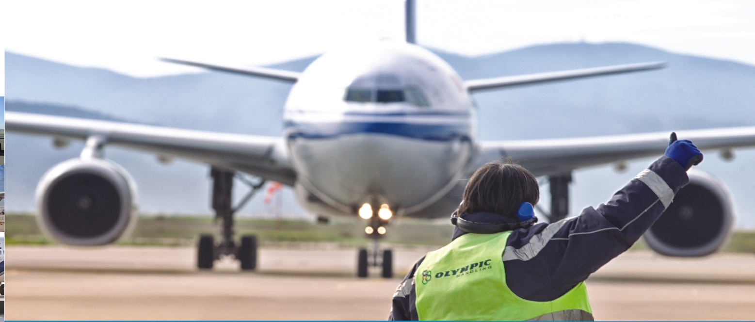
Ramp Handling Services