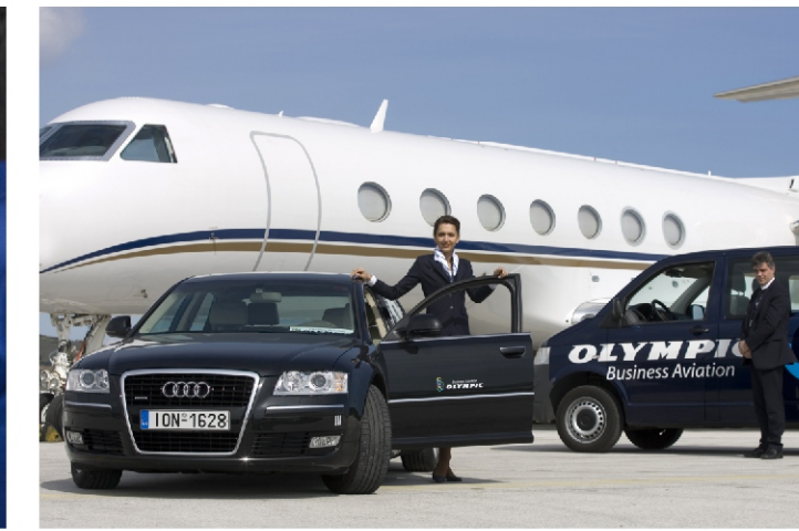
Business Aviation Handling Services