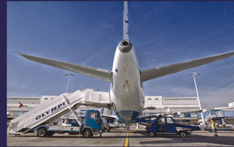
A market share of more than 40% of all Airlines arrivals and departures in Greece